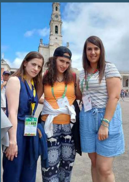
World Youth Day in Portugal